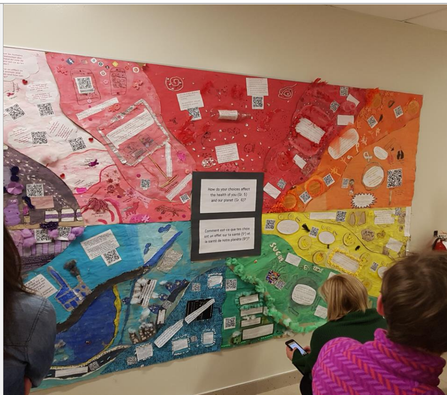
QR code were used and a voice recording presentation by a student can be heard by anyone who scans the QR symbols located around the projects artwork.